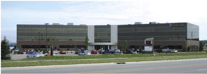
View of Can-Amera Corporate Centre from Can-Amera Parkway in Cambridge

The company's software, Lone Wolf Realty Management System, integrates and operates all facets of a realtor's administration and accounting. Lone Wolf's ERP-like system automates and handles all the daily tasks associated with a real estate office (from listings and transactions to closings and the issuance of commission cheques, including management of accounts payable, agent billing, month end reporting and production of financial statements.)