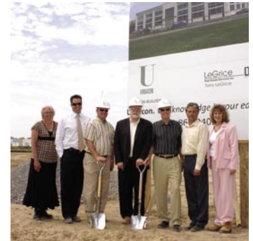
On July 3rd, 2007, Kodiak brought their employees to the site on Thompson Drive to celebrate the groundbreaking of their new 139,726 square foot distribution facility.

Currently, there are only four serviced industrial sites remaining in the City's industrial land inventory.