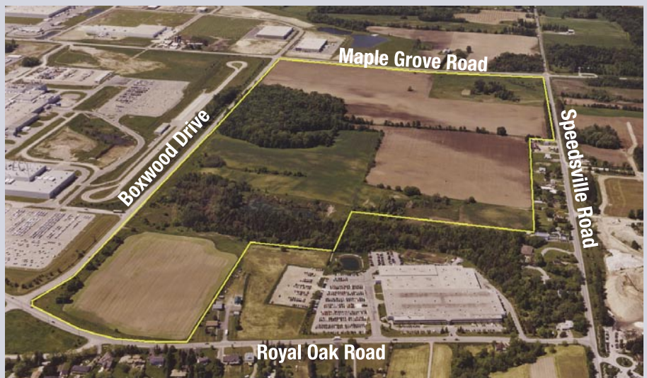
The City's next industrial development will be the 220-acre Boxwood site next to Toyota Motor Manufacturing Corporation.

The City's next industrial development project will be to develop their 220 acres of land on Boxwood Drive. This site is bounded to the north by Maple Grove Road, to the east by Speedsville Road, to the south by Royal Oak Road and the western limit is Boxwood Drive. City Council approved Delcan as the consultants to bring the project through the rezoning, Municipal Class EA, site design, and supervise the construction of this project. The planning approvals phase will extend to early 2008, and the earth works, grading and construction of the roads and services is expected to be completed by the end of 2008.