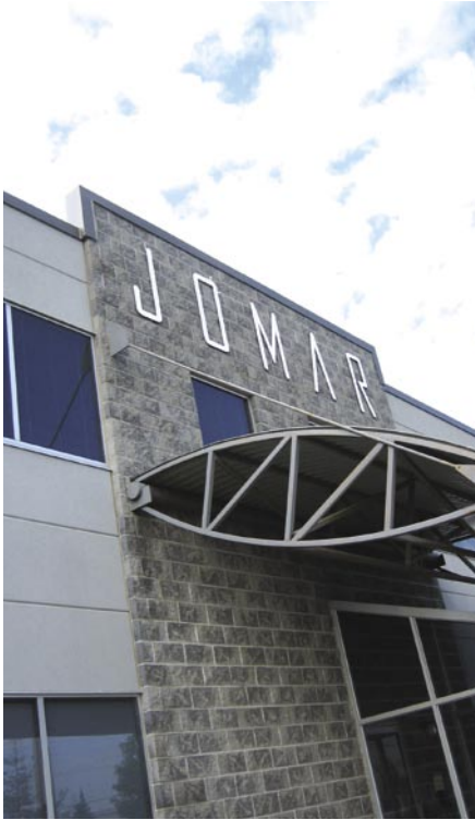
Jomar Softcorps International headquarters on 1760 Bishop Street in Cambridge.